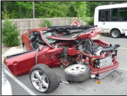
wrecked 2010 mustang gt

The article has been posted and commented on in the "MustangBlog", the source of the original article from July 2009 was retrieved from http://www.autoevolution.com/news/teens-destroy-a-2010-mustang-in-crash-8766.html . article date and author: 14th of July 2009 | 12:05 GMT | Alina Dumitrache, retrieved August, 23, 2010